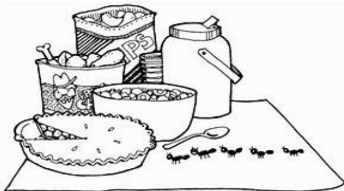
It's Picnic time!!

Our Church Picnic is scheduled for Today, July 28, 2019 at Bessemer Park After the 10:00 AM Mass