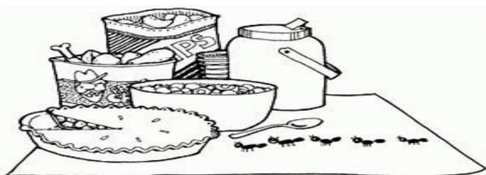
It's Picnic time!!

Our Church Picnic is scheduled for July 28, 2019 at Bessemer Park .